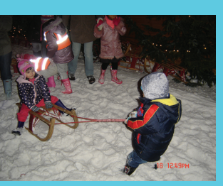
The nursery children enjoying the snow

Leicester City Council to improve the nursery's service to their users. As this trip was such a success, the nursery is hoping to spend some of the grant on another trip, this time to Beacon Hill in the Spring.